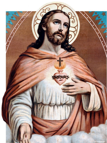
The Most Sacred Heart of Jesus